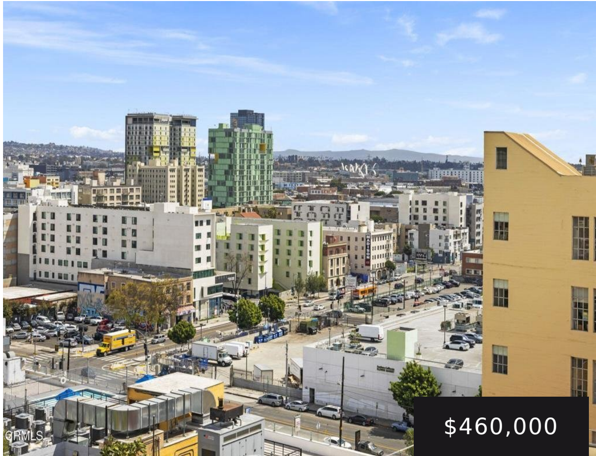
746 S Los Angeles St 1001, Los Angeles, CA 90014

746 S Los Angeles Street 1001, Los Angeles, CA, US, 90014