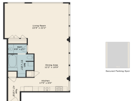
CBSMLS - Measurements are Standard Assesses and Estimates. All Not Guaranteed. Based On Public